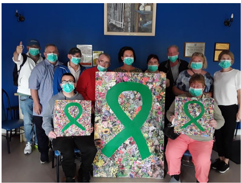
This collage was made in Platinum Clubhouse to celebrate Green Ribbon Month.